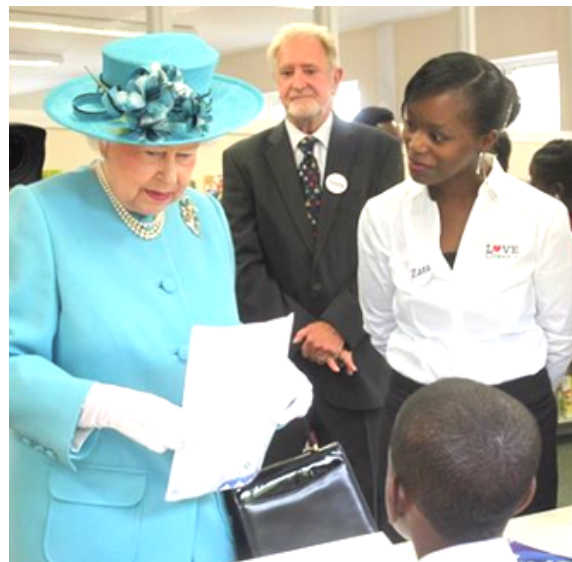
HRH Queen Elizabeth presented a special poem by Love Literacy staff and students, 2015.

Together with a team of experienced and trained staff, Love Literacy has become a highly-recommended education provision, due to its personalised teaching and learning. Here at Love Literacy, the learners' needs are at its core. Love Literacy has worked with Aspire AP School, Mayfield School, Thomas Knyvett College and Box Up Crime to support students.